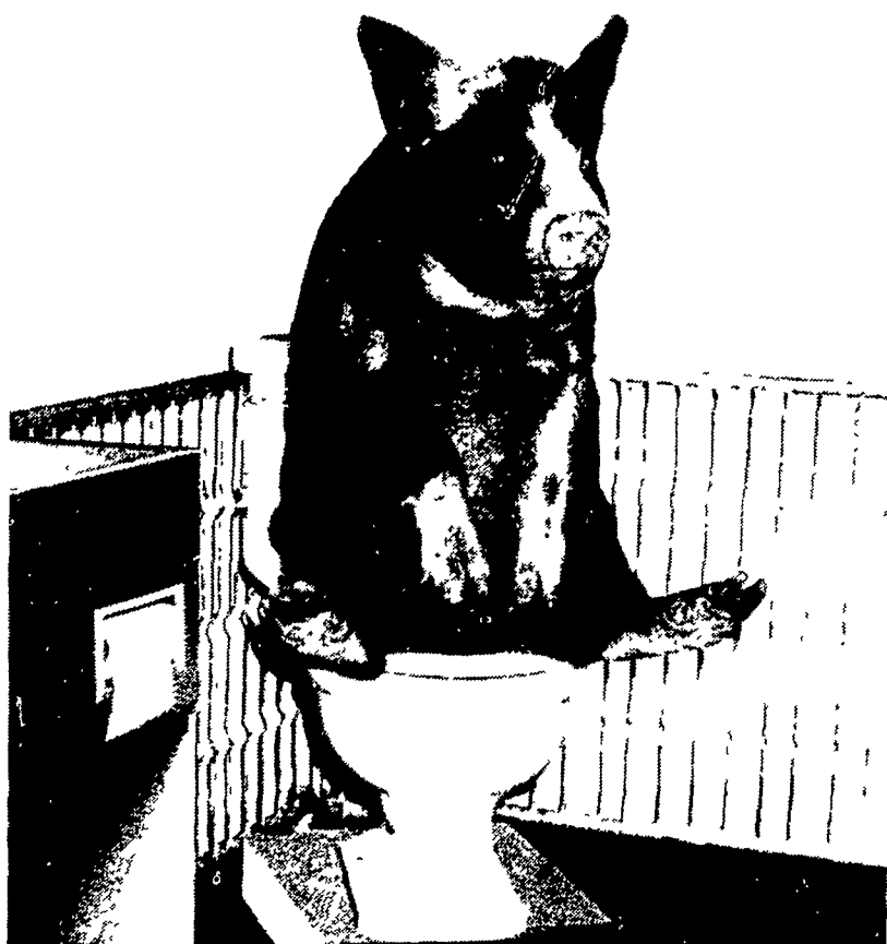
LISSCO'S WASTE HANDLING AND TREATMENT DESIGN FOR CONFINEMENT LIVESTOCK SYSTEMS IS THE NEXT BEST THING TO TOILET-TRAINED ANIMALS