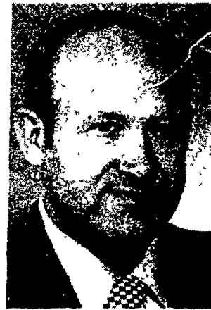
Manager of Purina Dairy Research

ATTENDANCE BY RESERVATION ONLY CALL YOUR PURINA DEALER