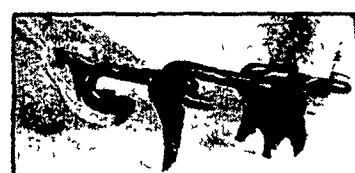
Patz double-hook gathering chain features knife-sharp cutters and claws for full-flow feeding.

Patz offers both ring-drive and surface-drive silo unloaders. The preset depth-of-cut control feature on the Patz 98B Surface-Drive Silo Unloader gives you truly automatic feeding. It eliminates monitoring of a winch and frees you to do other work while feeding. The Patz RD-820 Ring-Drive Silo Unloader offers the time-saving convenience of feeding immediately after repeated silo refills.