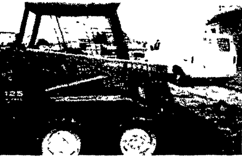
125 Skid Loader ..... $15,500