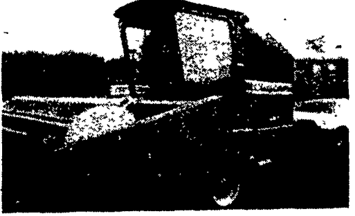
2420 Self Propelled MOWER CONDITIONER w/12' Auger HD. ..... $23,500