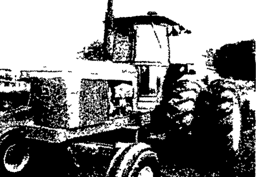
4630D TRACTOR w/Dual & Cab, 2454 Hours ..... $21,000