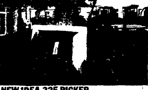
NEW IDEA 325 PICKER w/Super Sheller, 2 Row 30" Head ..... $5,495