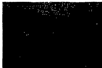
PLATE SHEARING & PRESS BRAKE WORK