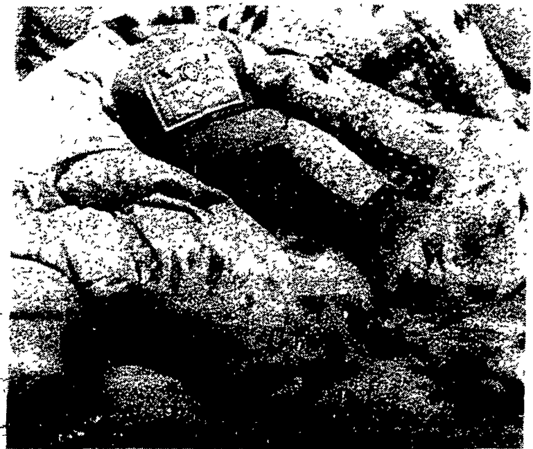
Two heads are better than one.