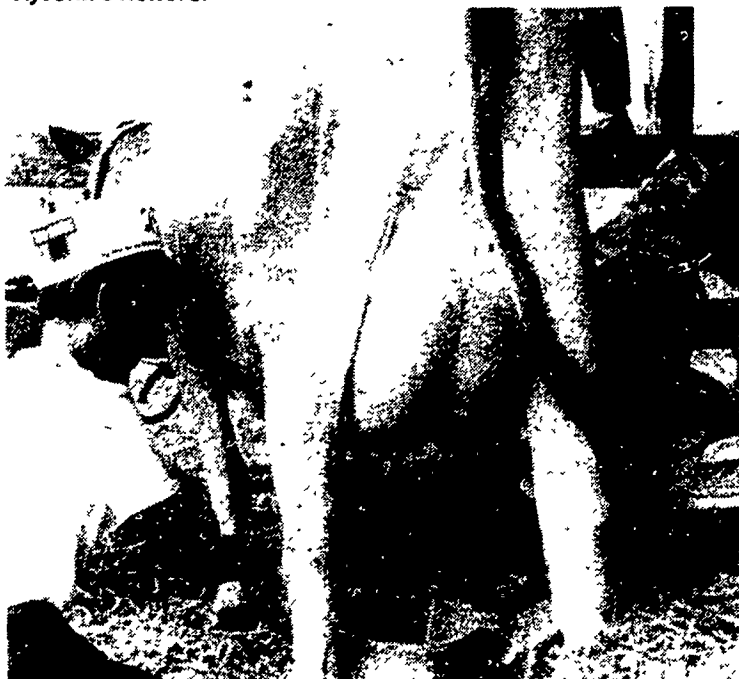
Tim Ulrich, left, of Quarryville, and Matt Bushong, right, of Columbia, share duties following the Solanco color breed show.