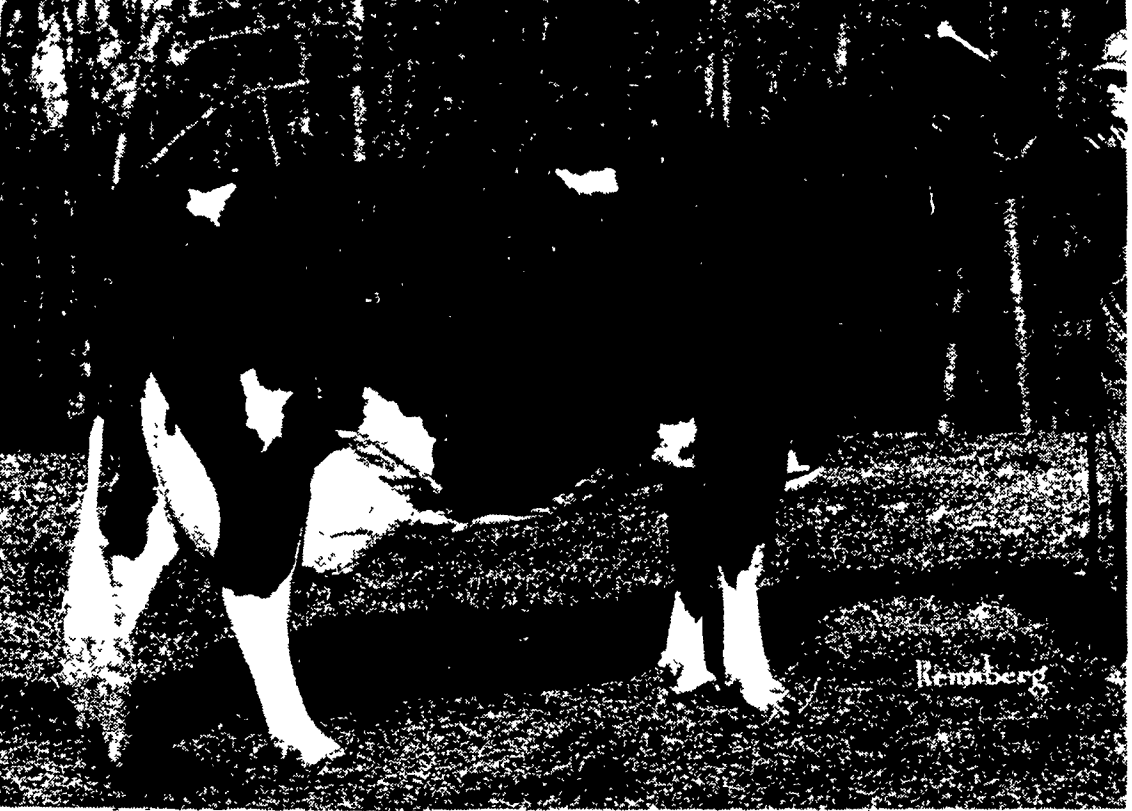
Lasso: "Grand dame" of the Mun-Cre her until her untimely death earlier this year, Mun-Cre Elevation Lasso, 2E-95, had a five-year-old