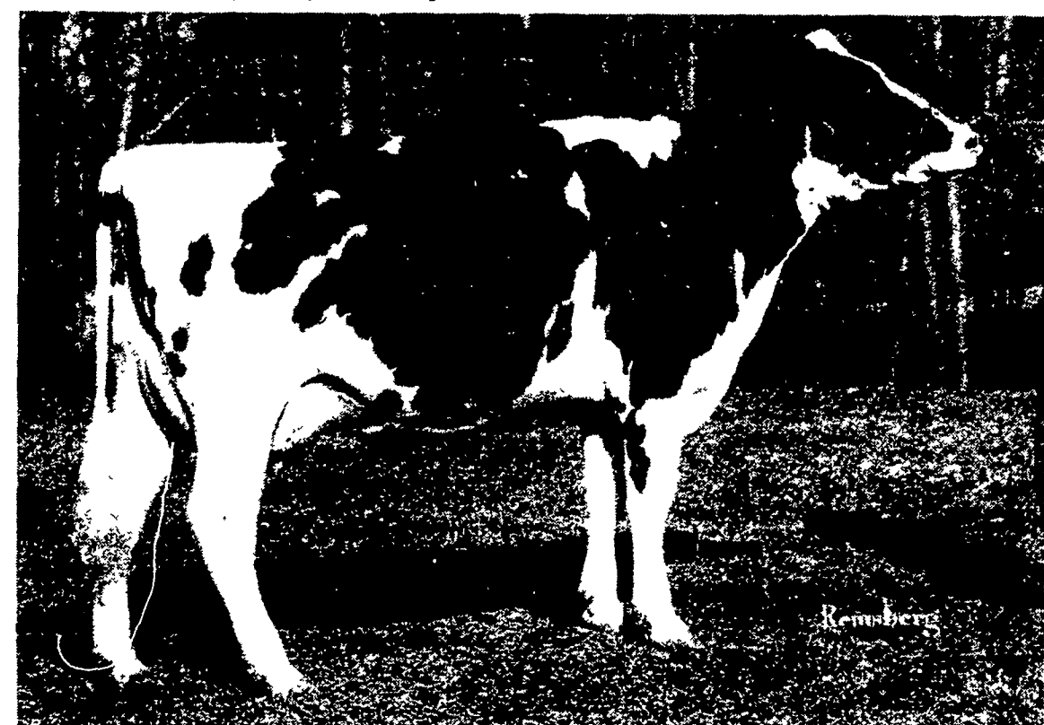
record over 30,000 milk and 1200 fat. Her sons are in use in both Japan and France.