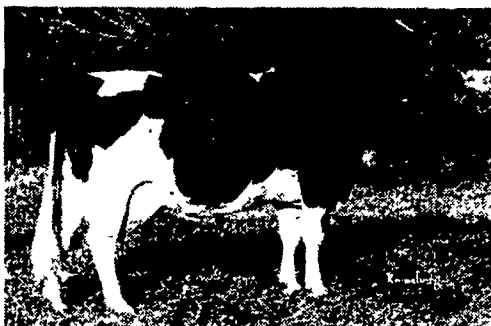
Glen-Valley Pin Mistress 2E-91

Sire: Kingpin 5-1 305d 21,891M 4.5% 989F