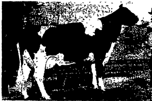
Swampy Hollow Elevate Charity E-90

Sire: Elevation 4-1 Est 305d 23,351M 3.8% 880F