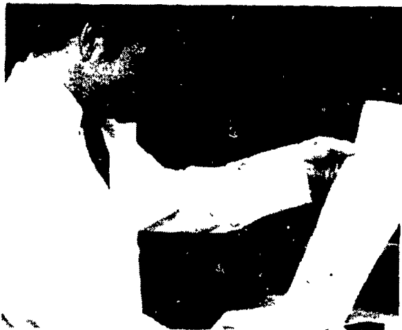
• Fast Roughage Analysis Service at no charge

You can see for yourself - Pennfield gives you the BEST FEED VALUE for your feed dollar... and