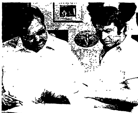
• Feeding Programs to improve your milk production