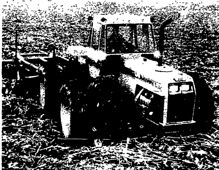
This 225-horsepower model is one of two new four-wheel drive tractors introduced by White Farm Equipment Company. The other is a 270-hp. model.