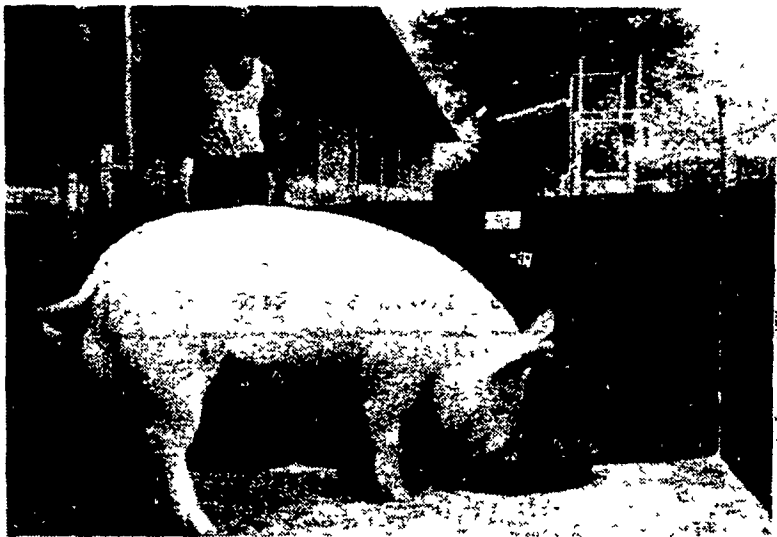
This 6-month-old Yorkshire boar topped Wednesday's Pa. 5th Performance Tested Sale with a $1,300 price tag. Bred by Calvin Lazarus and Sons of Whitehall, the high-tester was purchased by the New Jersey Department of Corrections.

A list of the breed averages follow: 24 Yorkshires — $583; 12 Durocs — $452; 3 Landrace — $533; 3 Spotted — $375; 1 Hampshire — $675; 1 Chester White — $350. — DYT