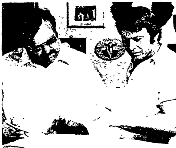
• Feeding Programs to improve your milk production