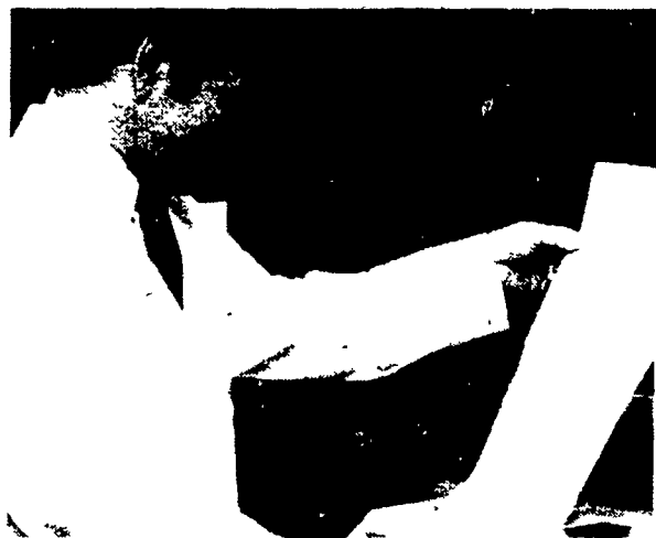
• Fast Roughage Analysis Service at no charge

You can see for yourself - Pennfield gives you the BEST FEED VALUE for your feed dollar... and