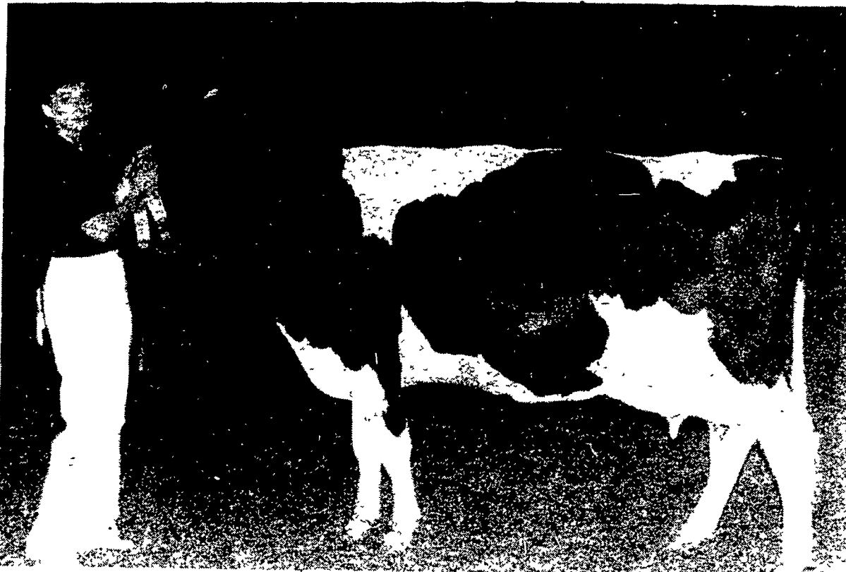
Le-Ida Miss Elevation Nora, 4-year-old, collected the Grand Champion title of the Holstein open show at the Carlisle Fair