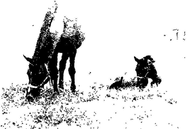
Hopes for the racing and breeding future of Willow Tree Farms' Thoroughbreds lie in this year's crop of youngsters, more of the legacy of Captain, My Captain.