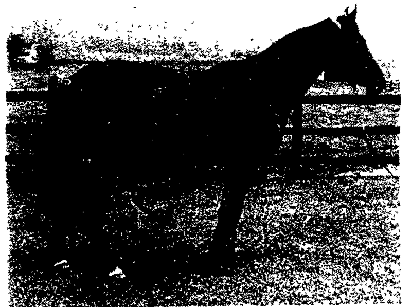
One of Willow Tree Farms' most promising untried yearlings is Captain Fire, a son of Captain.