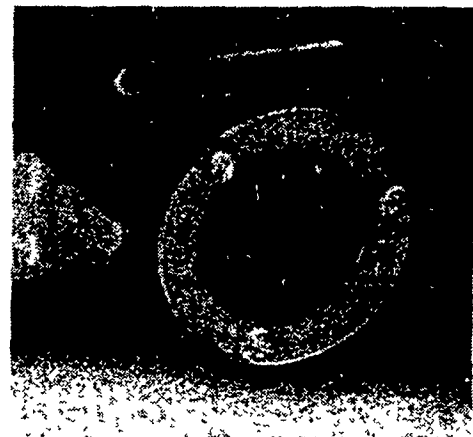
Arm indicator tells where sweep arm is located inside structure.

HARVESTORE HAS . . . AN UNLOADER FOR ALL YOUR FEEDS: