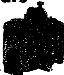
Closed Power Unit

Ideal for shops, agricultural generator sets, equipment, etc.