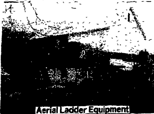
Aerial Ladder Equipment

FARM BUILDING PAINTING From No. PA to So. Maryland and De.; From NJ to Western PA