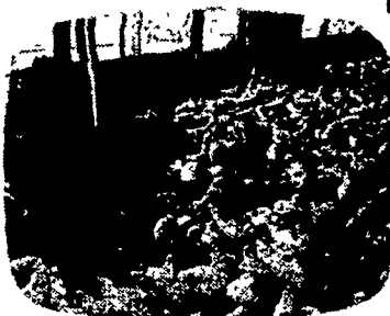
Broiler Pan Feeding System

"45 Years of Manufacturing For The Poultry Farmer"