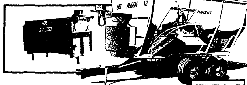
Mini Auggie shown (stationary only)

Visit your local Knight dealer for complete details.