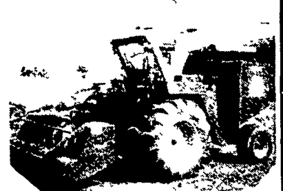
Fox G1000 S.P. w/V6-71 engine w/3 row N. head & pickup head