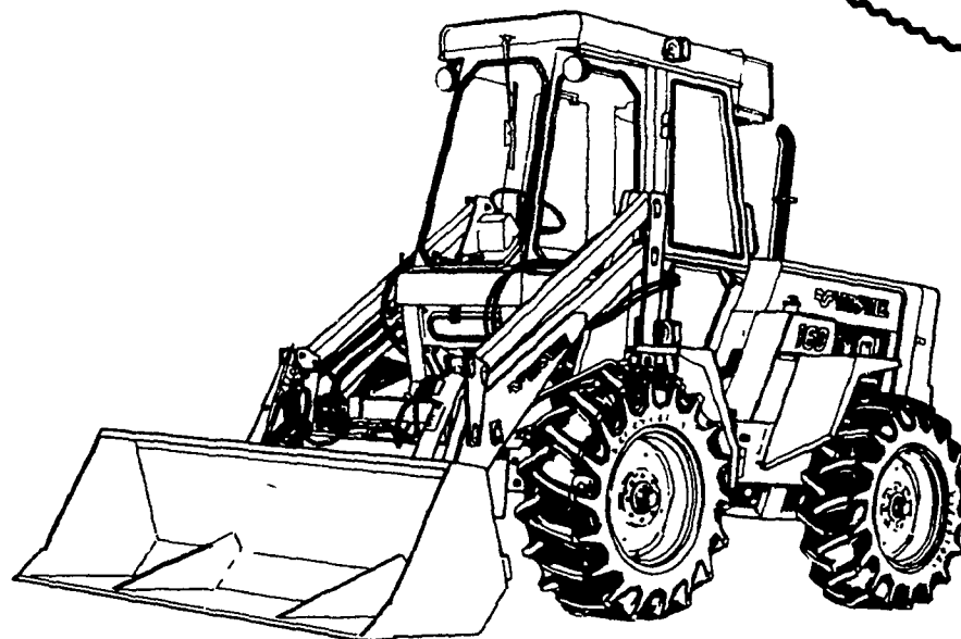
VERSATILE® 160 TRACTOR