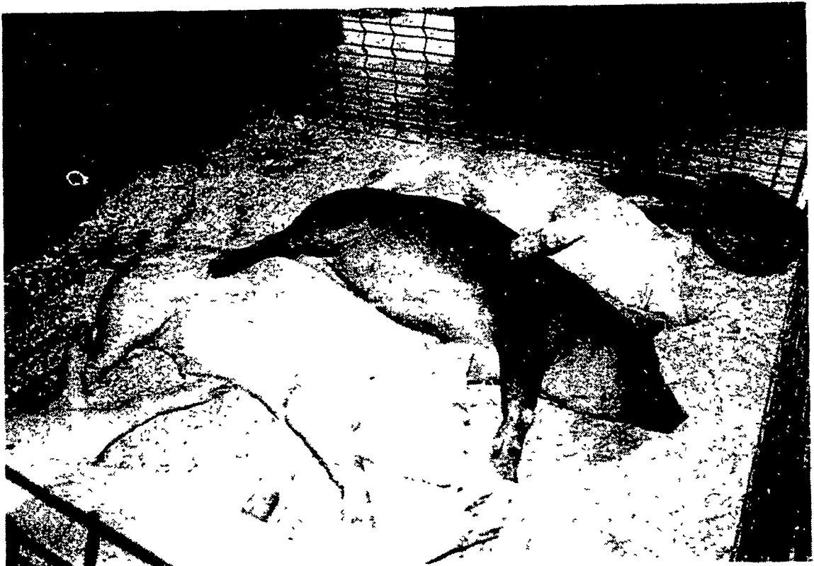
Here's what the recent heat wave does to a group of pigs — it makes them even more lazy than they already are. What a life these porkers live. They don't have to worry about paying bills — instead they make them. They

don't blink an eye at a dirty pen — instead they roll happily in dirt. They don't count calories and eat green vegetables — why should they worry about their diet when man is crazy enough to do it for them?