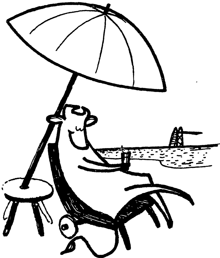
This cow knows how to beat the heat!

According to Reitnour, hot, humid summers make heat exhaustion a real possibility, so it's much better to take precautions than to risk the shock of collapse.