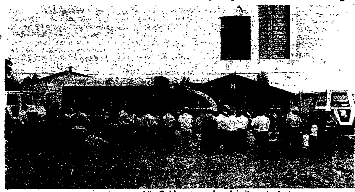
Farmers gather around chopper while Gehl personnel explain its major features.