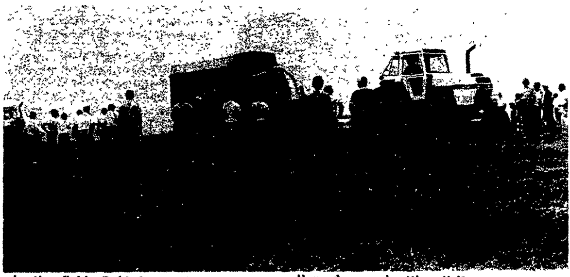
In the field, Gehl forage harvester with tandem axles demonstrates smooth ride