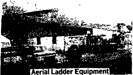
Aerial Ladder Equipment

FARM BUILDING PAINTING From No. PA to So. Maryland and De.: From NJ to Western PA