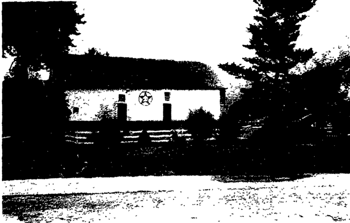
A visitor would have to look long and hard to find an unkempt area on the J.V. Farm in Douglassville, Berks County. The buildings are kept painted, the lawns in good order and the

fences maintained. Everything seems to be done for a pre-determined reason. And this technique is incorporated into his production practices also.