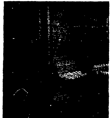
Collectors for hand gather or cross belts, 2, 3 or 4 deck made to your specifications.

19 years of Manufacturing Experience of Poultry Equipment and will Custom Make to your Specifications