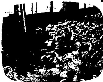
Broiler Pan Feeding System

"45 Years of Manufacturing For The Poultry Farmer"