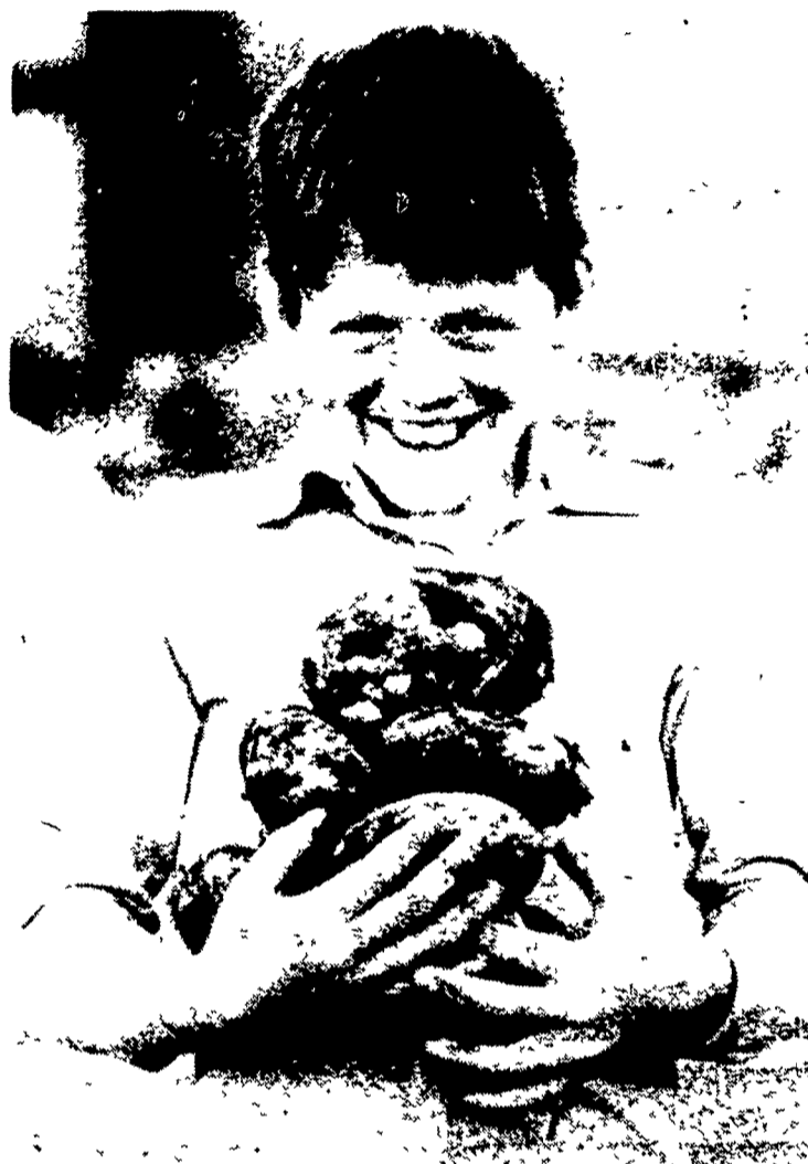
An Irish lad carries recently harvested potatoes home for his family's dinner. Valued worldwide for nutrition and versatility, spuds grow in more countries than any crop except corn. Although potatoes are native to South America, the Irish and East Europeans lead the world in per capita consumption.