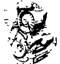
2 Cyl F2L-912

We Have SR2 12 h.p. Lister Diesels, as is or rebuilt.