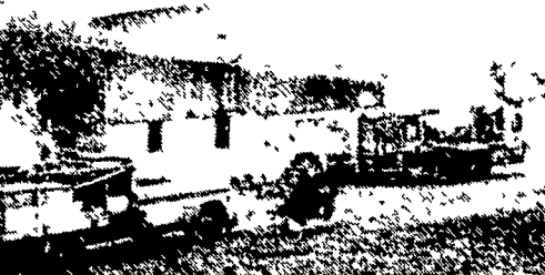
Aerial Ladder Equipment