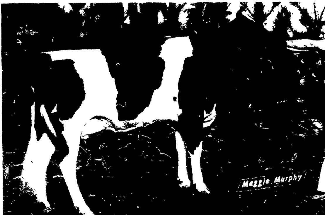
All-American 2 year old Killdee 1 Bubbler 89 Holstein is out of Killdee Astro Della Delight will be selling in the Killdee dispersal. Sired by SSF Gay Ideal Buffler, the Very Good a Very Good Astronaut daughter.