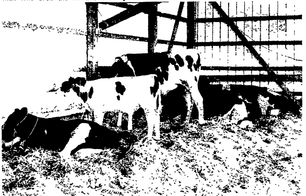
With sale neck tags already in place, a few of the Killdee animals spend their last days at Killdee, relaxing in ample straw bedding.