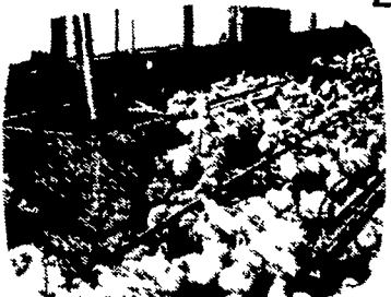
Broiler Pan Feeding System

"45 Years of Manufacturing For The Poultry Farmer"