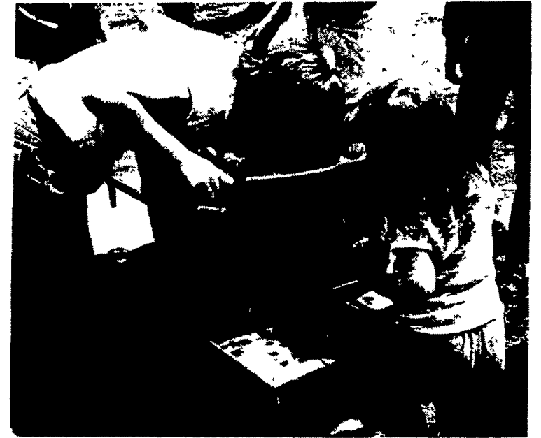
For the light at heart, contests are an annual event. Here children bob for apples and after this, they'll probably take part in the pie eating contest.