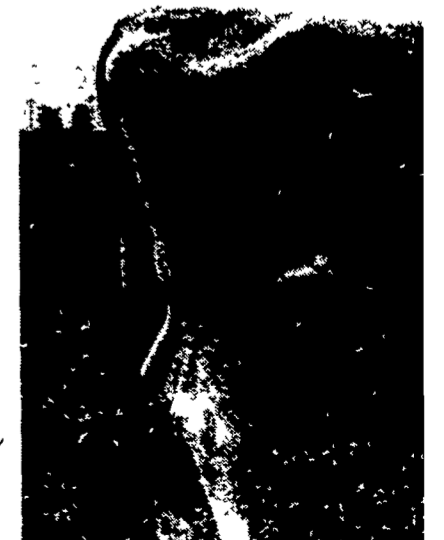
No stranger to the show ring, Suzanne Rich nailed down a Grand Char