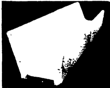
Feneline Feed Bunk - Smooth surface, rounded corners for less waste