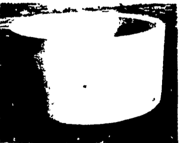
Stock Tanks - Approved by Soil Conservation Service for a clean, reliable water supply