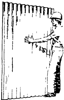
6'7" x 46" Sheet