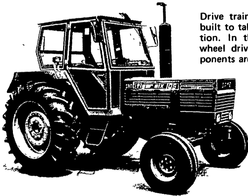
TIGER SIX 105 2-Wheel Drive

Drive trains and transmissions are ruggedly built to take the extra stress of 4WD operation. In the 2WD model, only the front wheel drive is eliminated — all other components are unchanged.