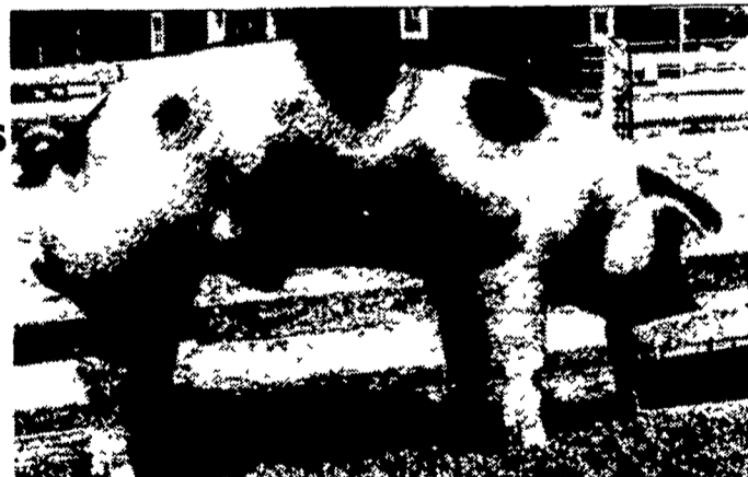
OUR NEW HERD BOAR - FSF "CORNERSTONE"