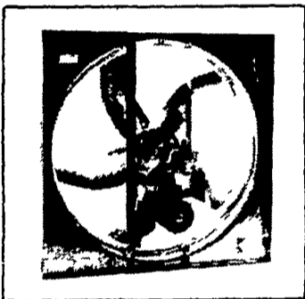
Frame and fan opening are one-piece, all galvanized construction for longer life and durability.