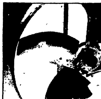
Unique compound curve fan blade designed for efficiency, lower operating costs.