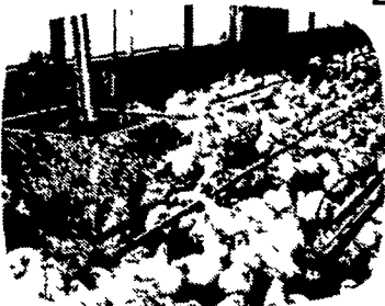
Broiler Pan Feeding System

"45 Years of Manufacturing For The Poultry Farmer"