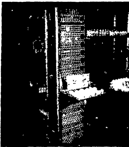
Collectors for hand gather or cross belts, 2, 3 or 4 deck made to your specifications.

19 years of Manufacturing Experience of Poultry Equipment and will Custom Make to your Specifications