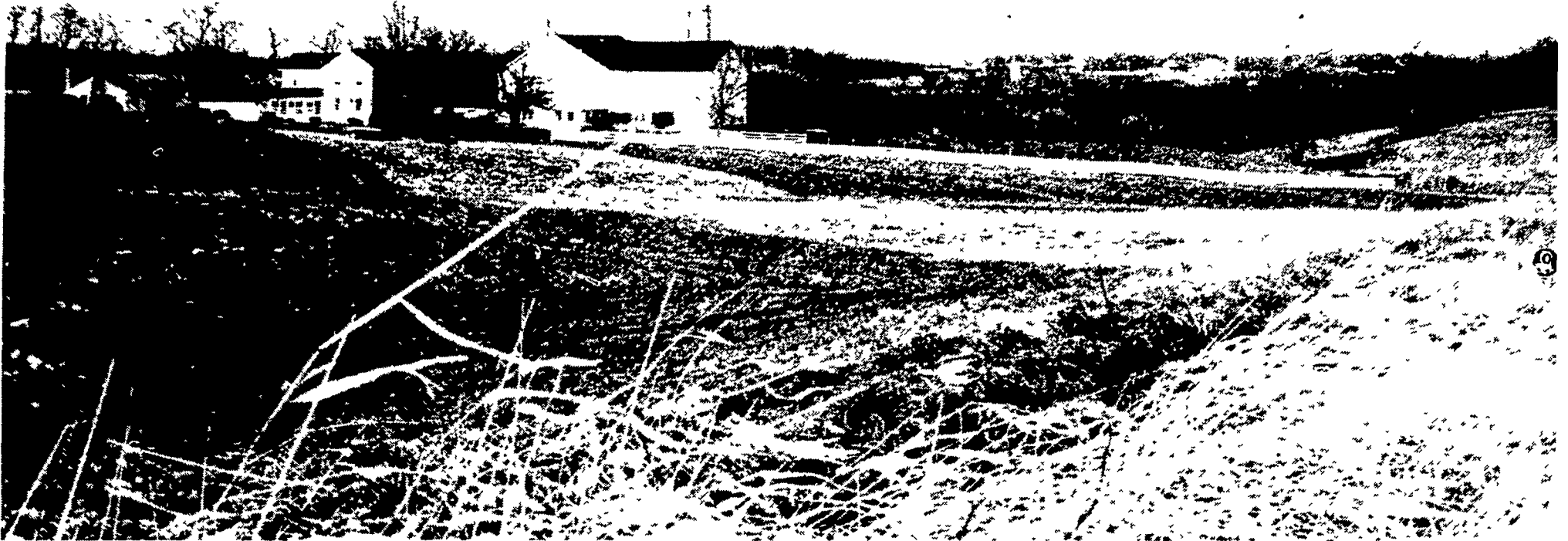
Wakefield, Lancaster County