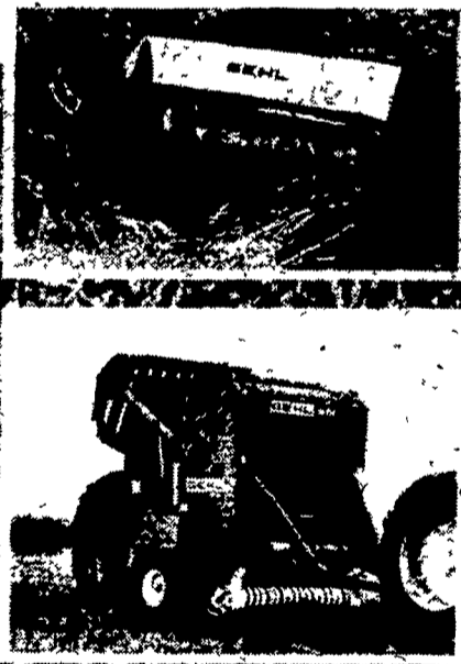
Top left inset photo shows protective shroud lifted for illustration purposes only. Lower before use

Waiver of finance on all Gehl equipment until June 1, 1982 or August 1, 1982 on Forage Harvesters with row crop attachment only.