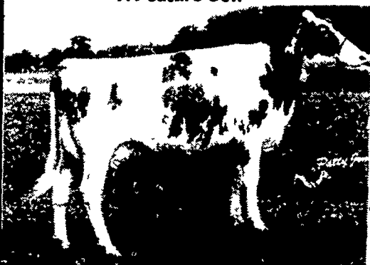
Val Brilliant Rina-Red (GP) 1Y 319d 15305 524