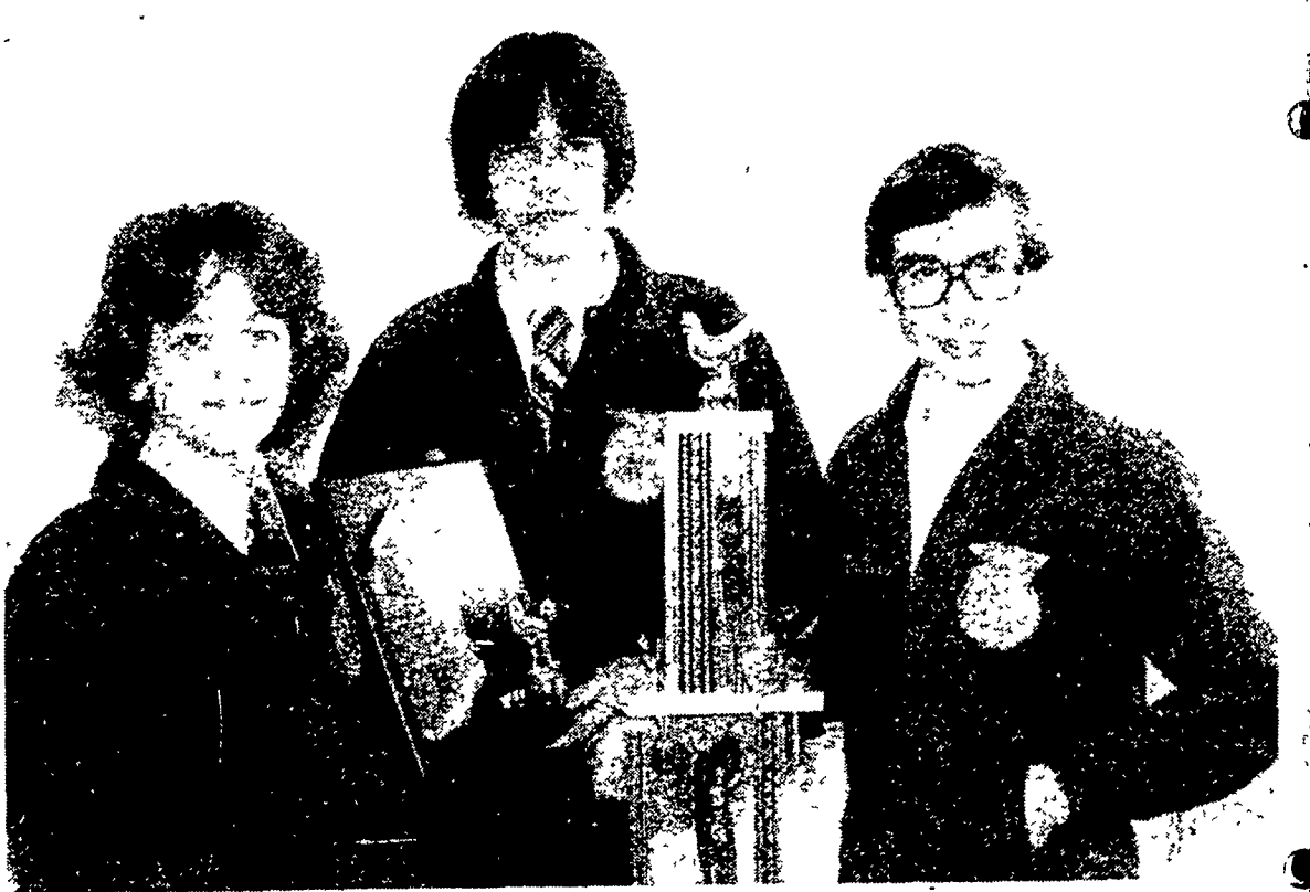
Winners of both Lancaster County team trophy and Tri-County Trophy in poultry judging competition are members of team from Grassland FFA Chapter of Garden Spot High

the competition. The high schools included Ephrata, Warwick, Solanco, Penn Manor, Elizabethtown, Manheim and Garden Spot in Lancaster County; Dover, Eastern York and Red Lion in York County and Oley Valley and Twin Valley in Berks