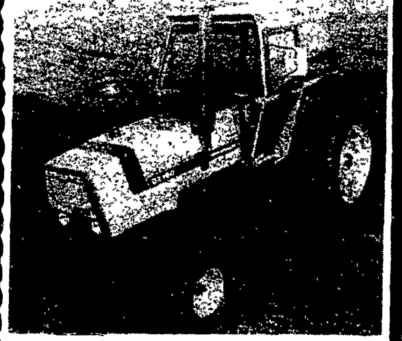
43 Thru 145 H.P. Tractors

Buy your fuel saver tractor now. Remember DEUTZ is famous for it's durability, reliability and economy.