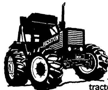
Introducing fuel-efficient tractors from Flat