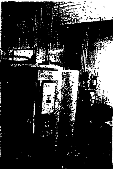
Therma-Stor heat reclaiming units