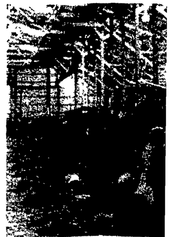
Zimmerman self-lock with tile feed trough.