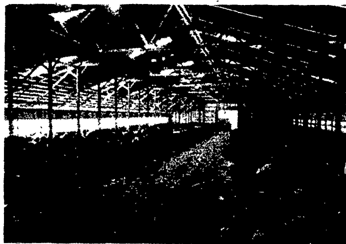
Interior view of cow barn with drive thru feeding system

See the new 90'x212' freestall cow stalls and 40'x52' milking area designed and engineered by M Building Systems.