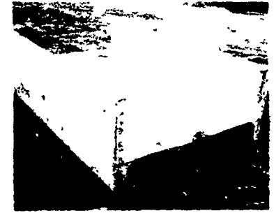
Centerline Feed Bunk -Adaptable to all types of overhead feeding