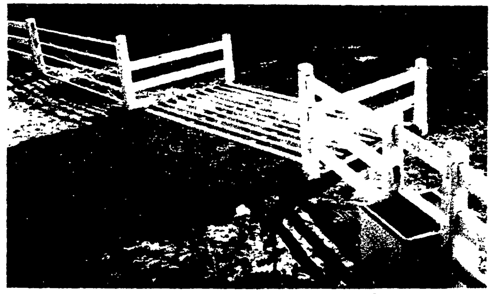
The Smith Cattleguard · No. 1 in the country. Save the time and energy of opening and closing gates.