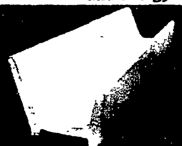
Fenceline Feed Bunk - Smooth surface, rounded corners for less