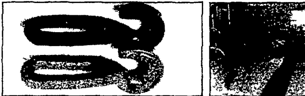
Heavy-duty link (top) and extra heavy-duty link (bottom) for long chains and heavy loads