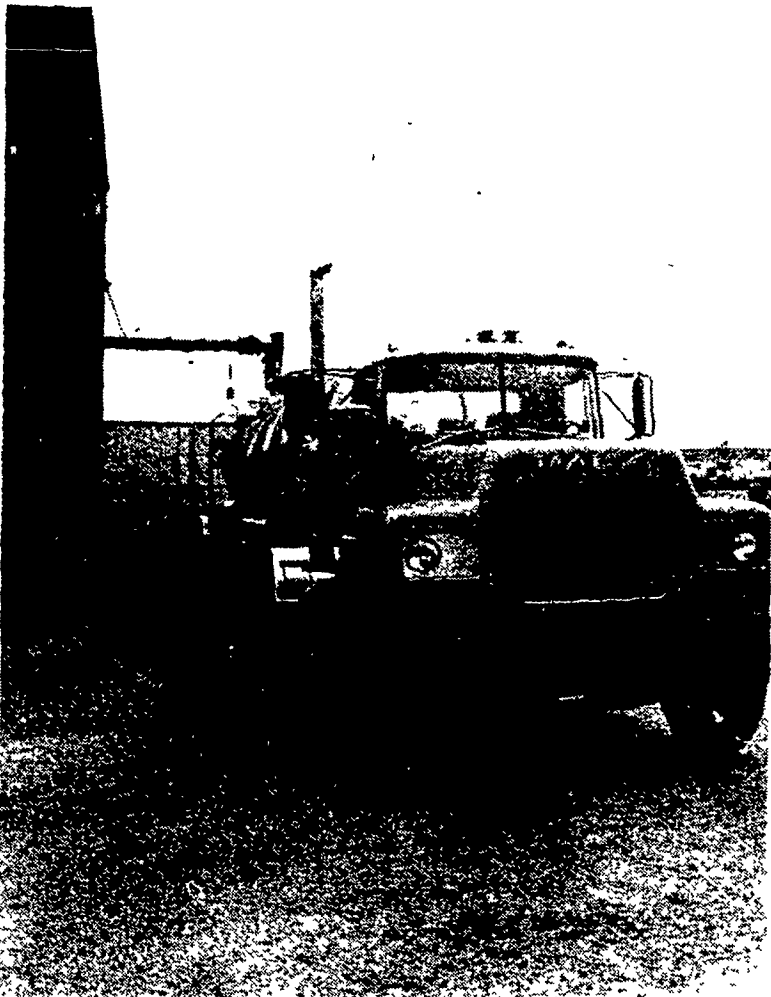
The sludge is loaded in the "Big A" from a 6,000-gallon tanker truck. Due to the size of the tanker, use of the "Big A" is sometimes limited depending on terrain.

the exact amounts applied and the content of the sludge. Upon completion, the farmer receives a summary sheet listing the date of application, the farm, which fields were covered, the percentage of N-P-K, the time, gallons, and the tons of dry matter. The farmer can use