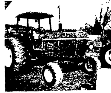
We Sold - 1977, 1 Owner, 1100 Hrs., Like New $15,800.00