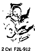
2 Cyl F2L-912

SALES & SERVICE on NEW VM and DEUTZ DIESELS